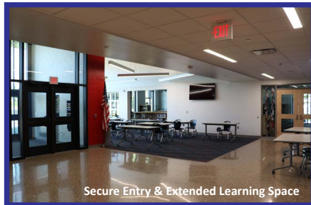
Secure Entry & Extended Learning Space

In addition to the ribbon cutting, families and members of the community were invited to tour the building for an Open House. Thank you for joining us and for the continued support.