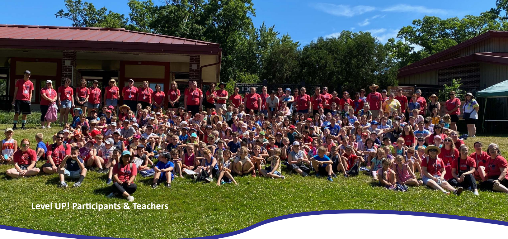
Level UP! Participants & Teachers