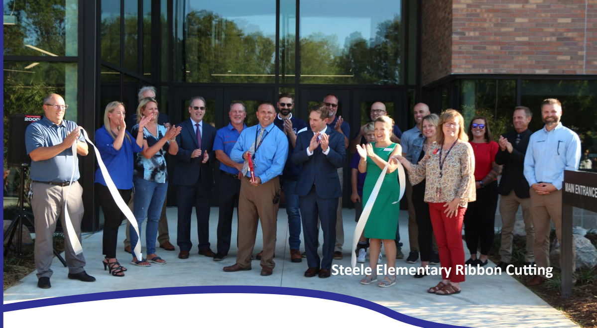
Steele Elementary Ribbon Cutting