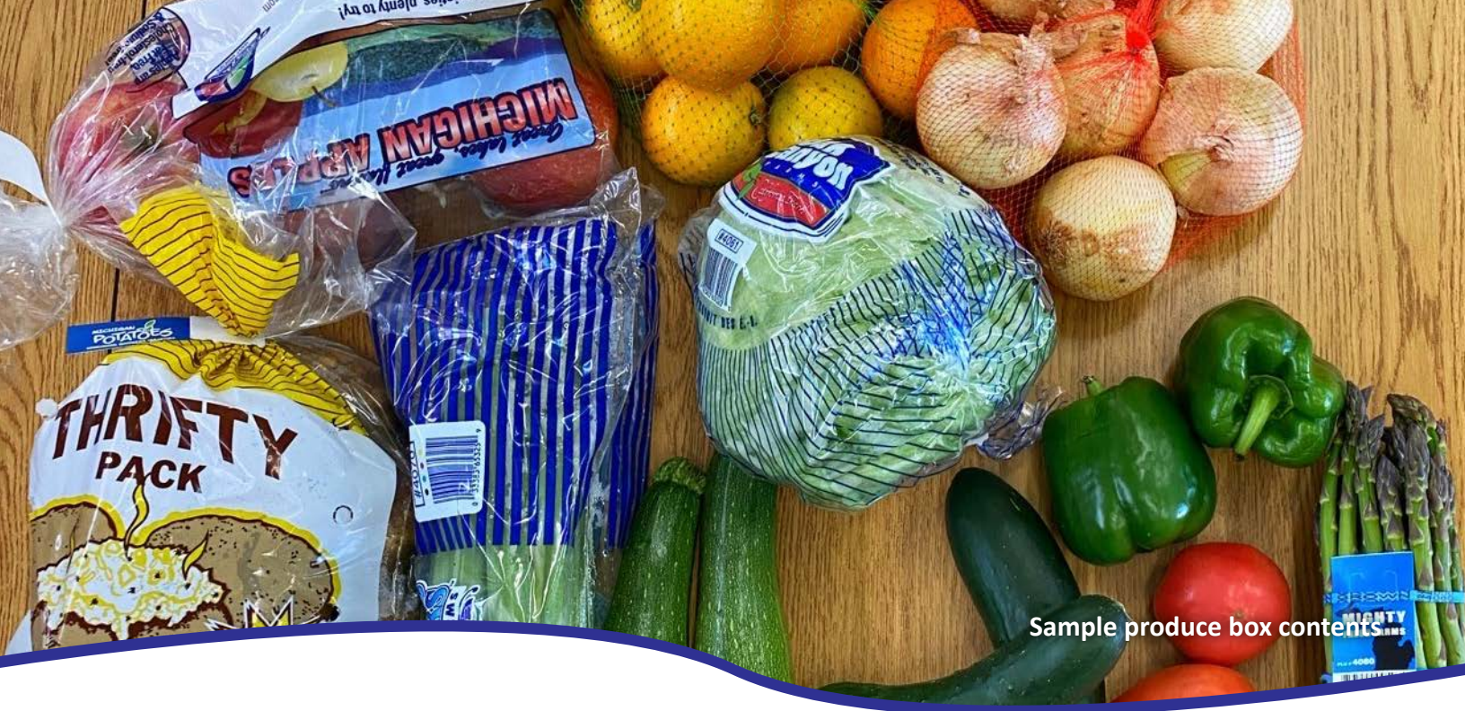
Sample produce box contents