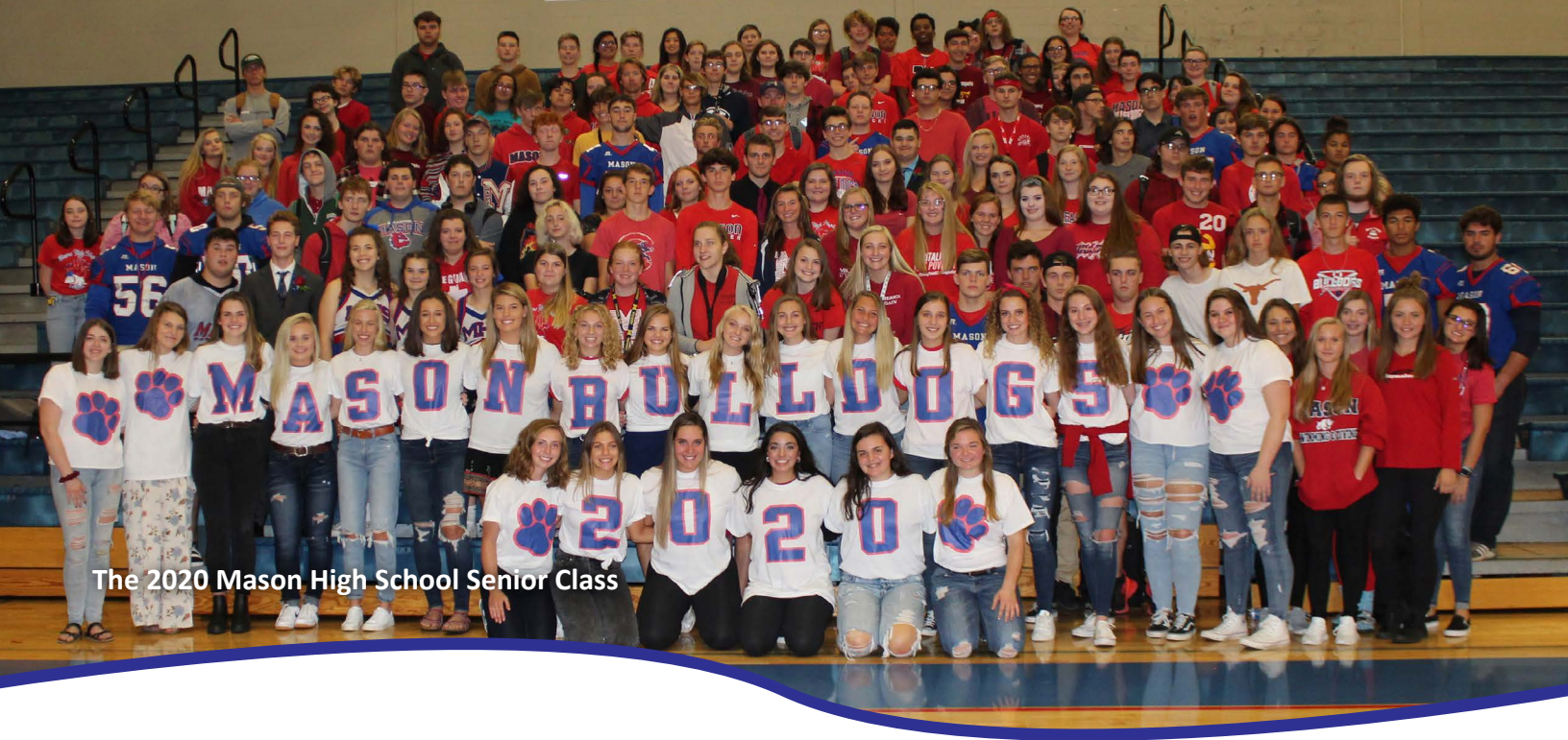
The 2020 Mason High School Senior Class