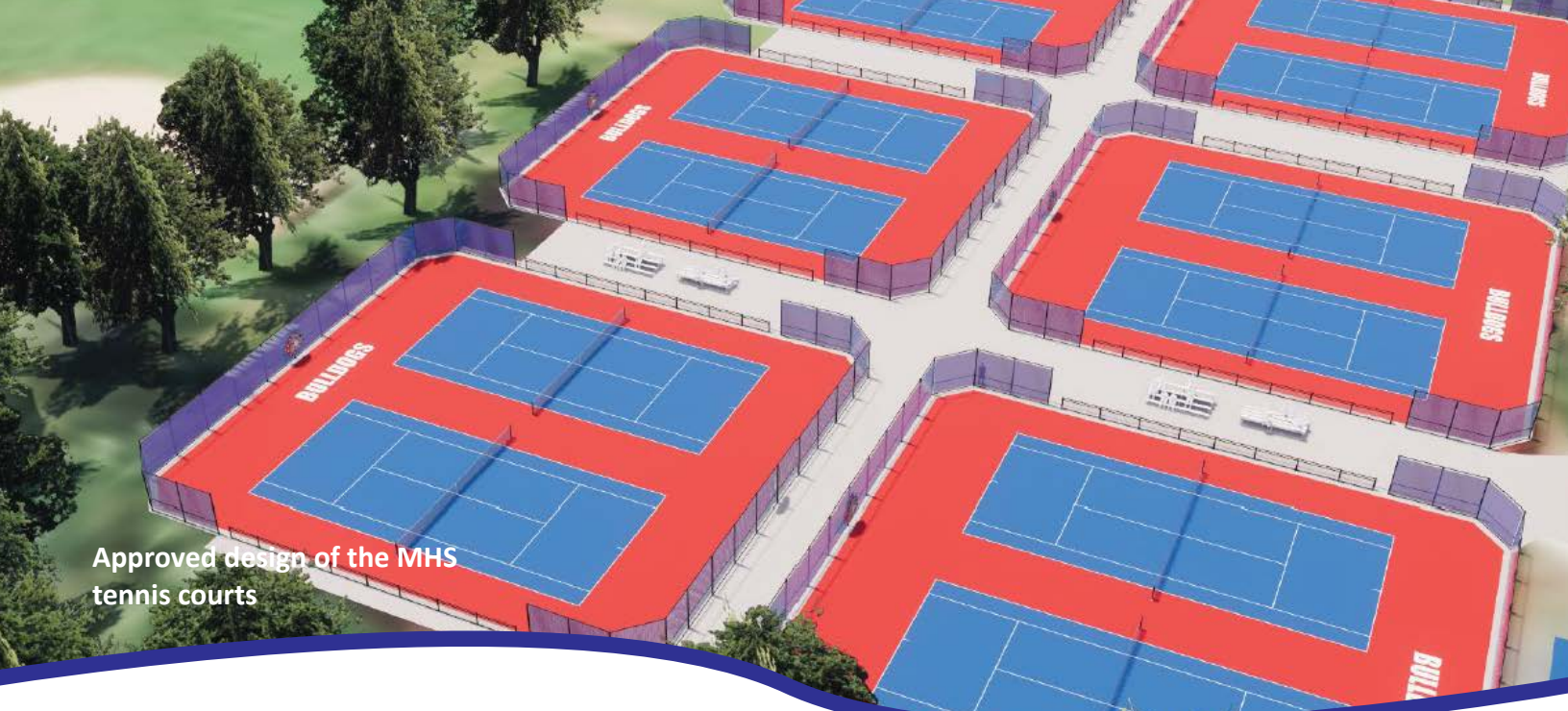
Approved design of the MHS tennis courts