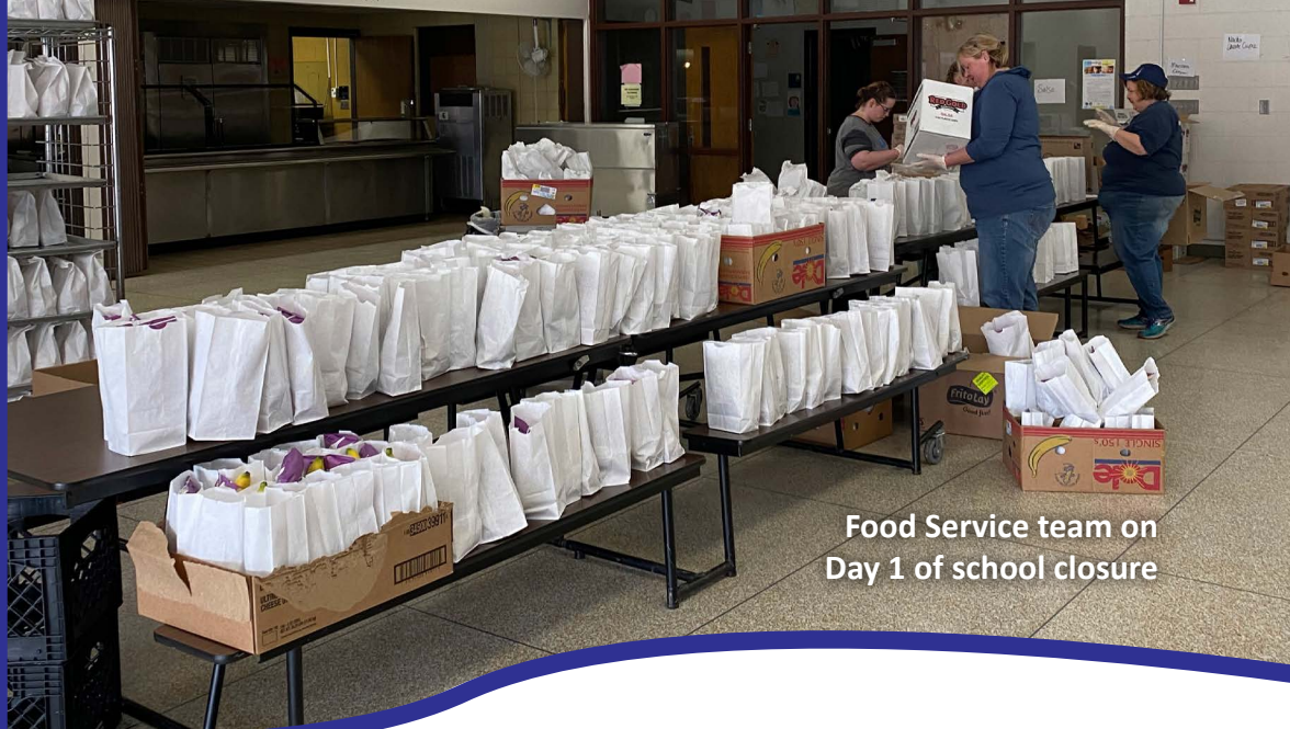
Food Service team on Day 1 of school closure