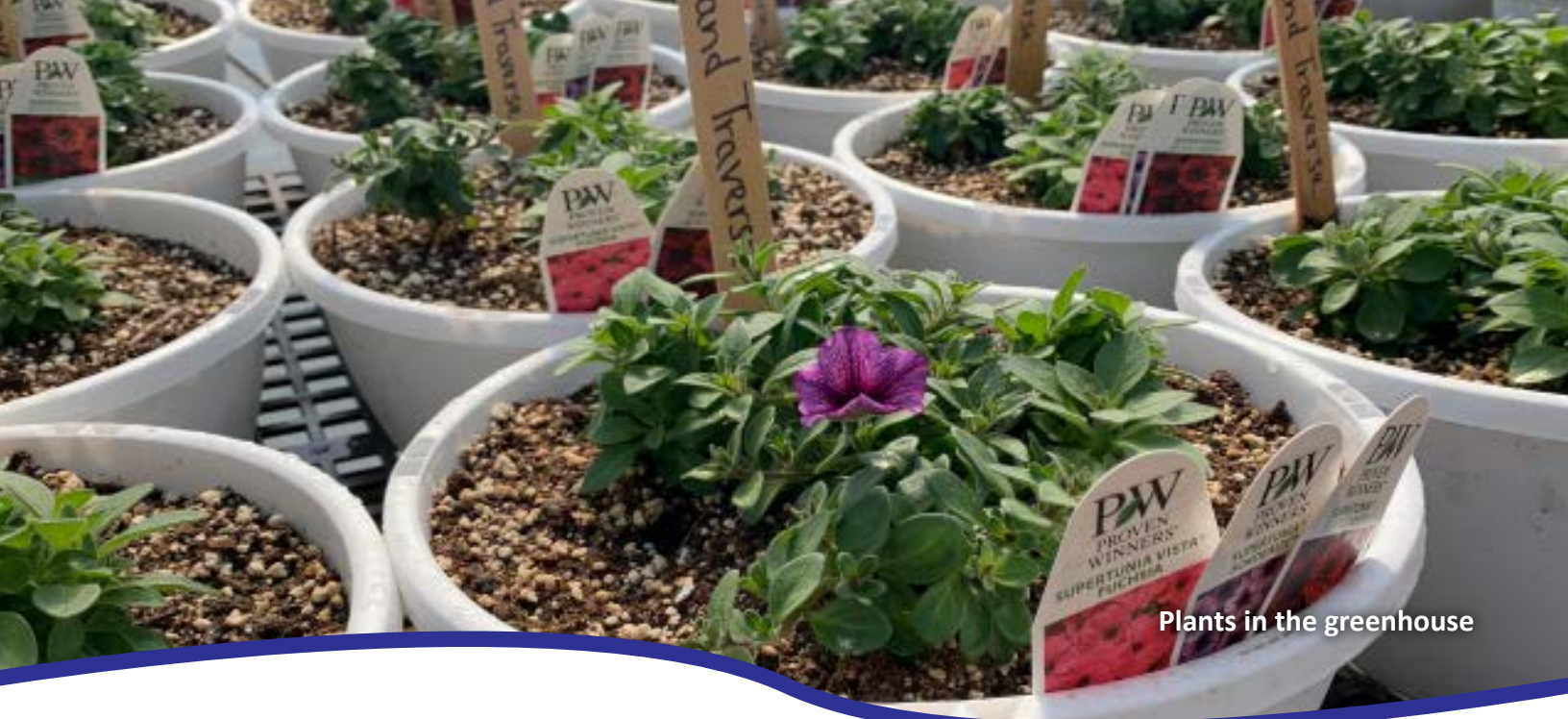
Plants in the greenhouse