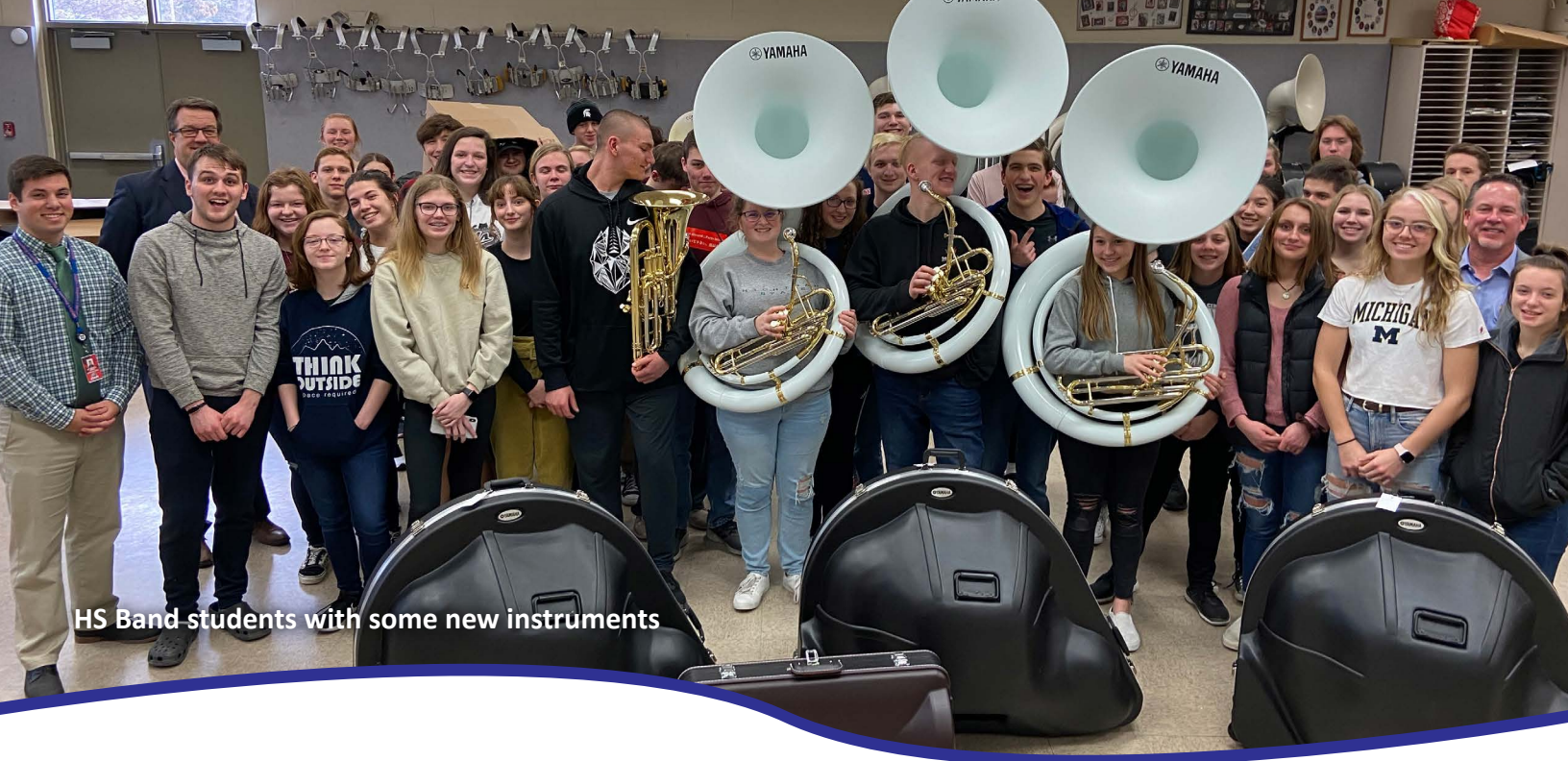
HS Band students with some new instruments