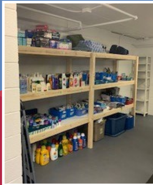
Mason Optimist Closet