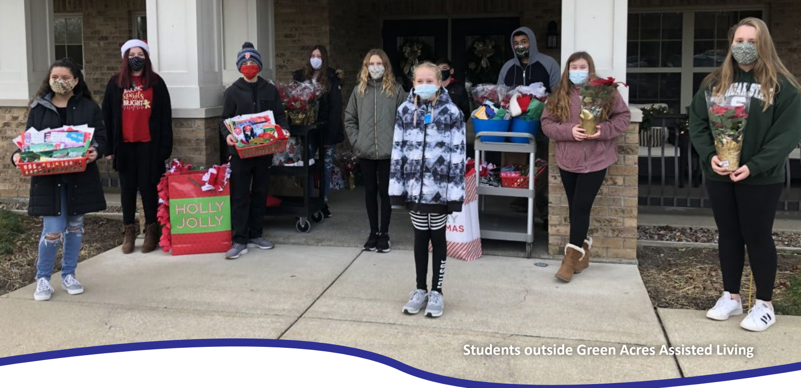
Students outside Green Acres Assisted Living