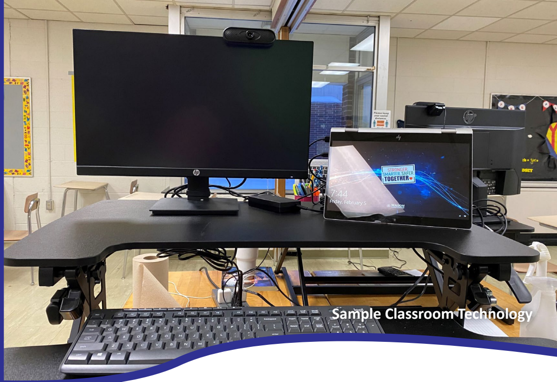
Sample Classroom Technology

Mason Public Schools Receives a $45,000 United States Tennis Association Grant Page 7